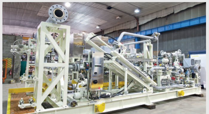
Nexen Petroleum Golden Eagle Oil & Gas Metering (UK Offshore)