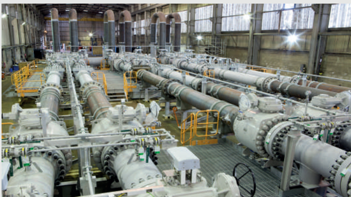
BP South Caucasus Expansion Project (Georgia)