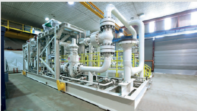
BP Clair Ridge Metering Package (UK Offshore)

We are approved by a wide range of operating companies worldwide which include BP, Shell, Chevron, BG, Saudi Aramco, PDO and ADNOC Group Companies, KOC and KNPC. We are also registered on the FPAL and Achilles databases for the UK (Supply Line) and Norway (JQS).