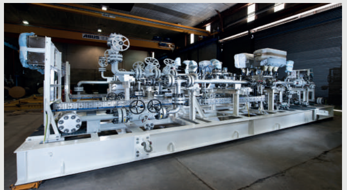
Nexen Petroleum Aoka Mizu Fuel Gas Import Metering System (UK Offshore)