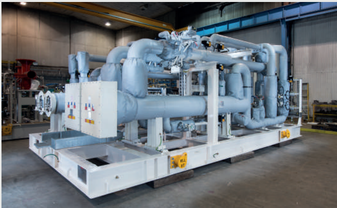
BP Shah Deniz 2 Fuel Gas Treatment Package (Azerbaijan, Offshore)

Our installed systems are conditioning feed gas for all major gas turbine manufacturers including GE, Siemens, Rolls-Royce and ABB.