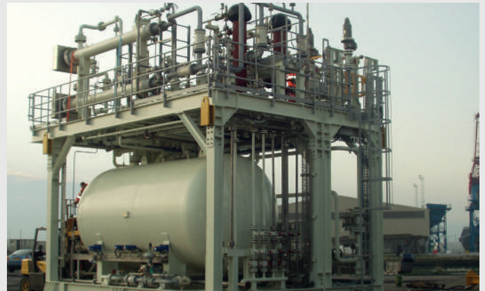
EnCana Buzzard Fuel Gas Conditioning Package (UK, Offshore)