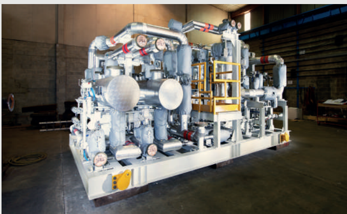
Mellitah Bouri Fuel Gas Treatment Package (Libya, Offshore)